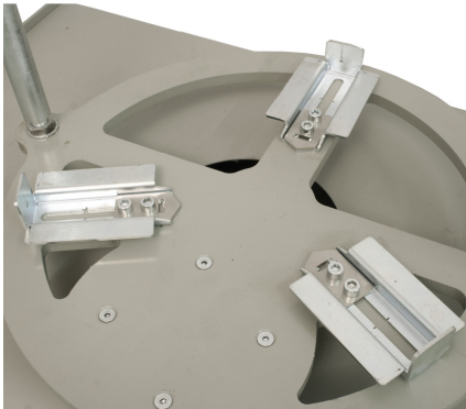
Detail of the fast clamping system