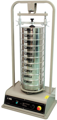
Electromechanical sieve shaker model 15-D0410 with dia. 300 mm sieves, and base plate 15-0410/1